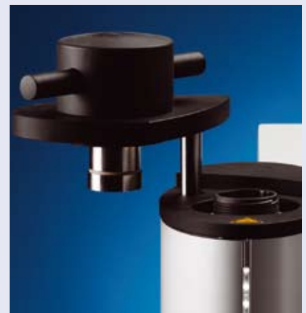
Top closure elevator for easy handling