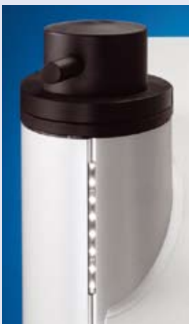
LED bar for remote signalling

The CitoPress top closure is with triple-thread. Thus, the entire process of mounting the top closure follows with a minimum of effort.