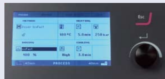
Fast and easy selection: The large display and the turn/push-knob facilitate a fast selection of selection parameters