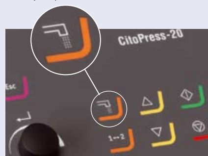
Intuitive operation: Push a single key to activate the automatic dosing system

CitoPress can reduce mounting times to nearly one third, compared to competing presses. (Applies for a 30 mm dia. cylinder. When using a 40 mm dia. cylinder CitoPress can reduce mounting times by half)