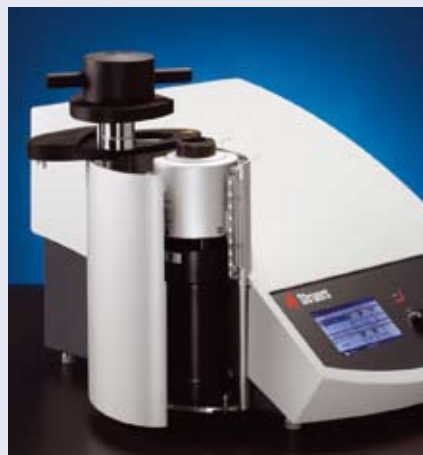
Easy access means quick change of mounting units and easy cleaning