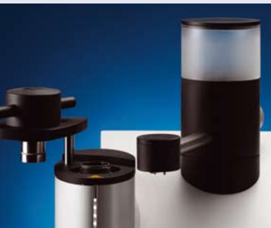
CitoDoser: Automatic dosing option

A dosing unit is linked to a specific resin by a RFID chip, which is recognized by the mounting press. In turn, when using CitoDoser, the last used method is automatically stored and recalled when the relevant Doser is placed on the press.