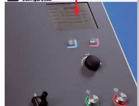
Discotom-60/65 is equipped with a large easy-to-read display and user-friendly turn/push knob and joystick.