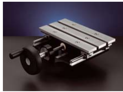
Parallel cutting table (option) for cutting of multiple slices.