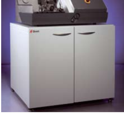
Optional table unit