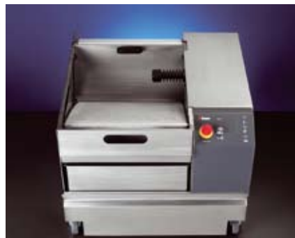
The Recirculation Cooling System extends the lifetime of the cooling water, and effectively removes swarf (option).