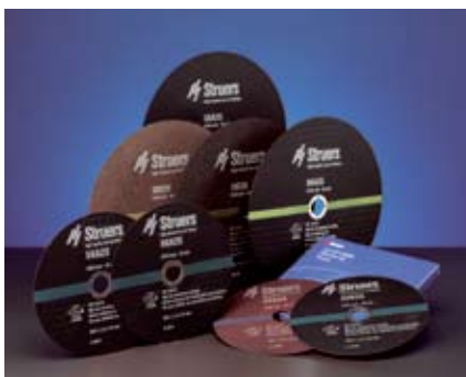
Struers cut-off wheels are especially designed for Struers machines, taking into consideration the most recent developments in wet cutting techniques.

The top of the cutting table is fitted with stainless steel bands which are very resistant to corrosion. If damaged, the steel bands are easily exchanged.